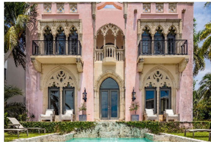
MANSION GLOBAL The Listings of the Week: A Waterfront Spec House in the Hamptons, an Irish Estate and More