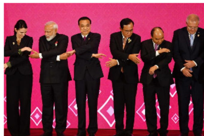
ASIA Asia-Pacific Countries Push to Sign China-Backed Trade Megadeal