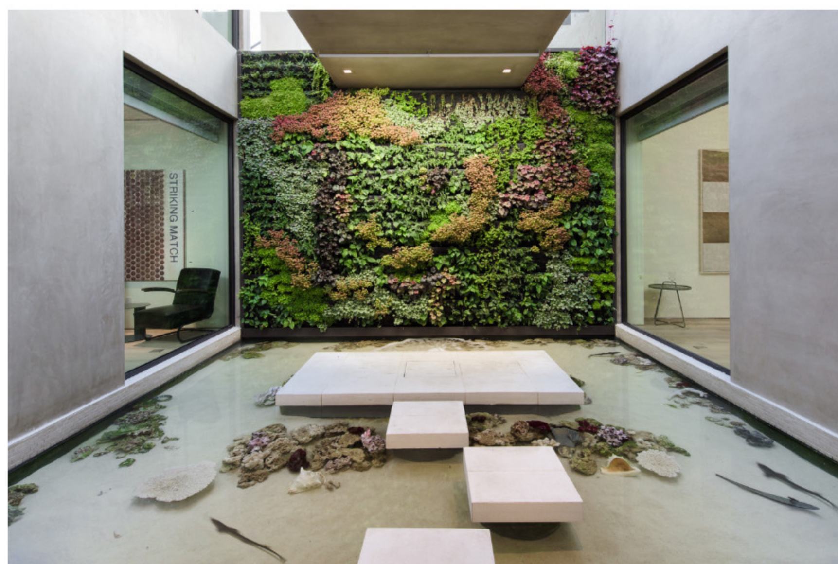
In the Hollywood Hills, the newly built home with a roughly 300-gallon indoor tank containing around 8 sharks is asking $35 million.

The Los Angeles property also comes with a cigar room, hot tubs, specialized tequila freezer and other fish. Current owner seeks a billionaire like the one on 'Shark Tank'