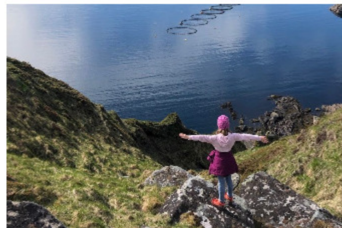
A-HEAD World's Explorers, Hemmed In by Pandemic, Offer Tips for Coping With Lockdown