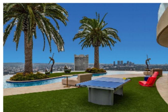
SLIDESHOW A Haircare Duo's Colorful Hollywood Hills Hideaway