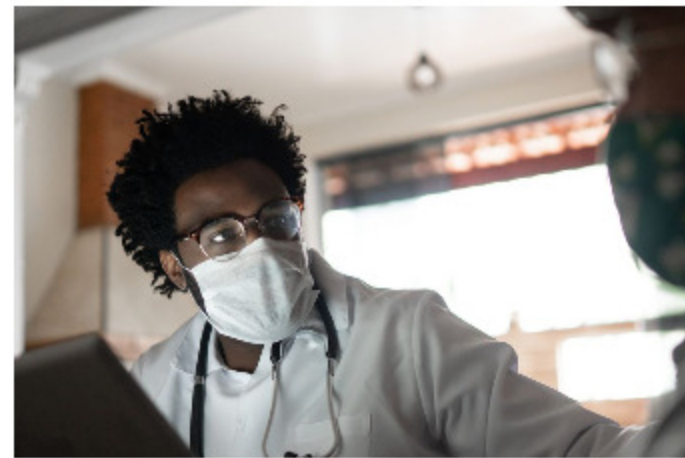
MARKETWATCH Mammograms and colonoscopies fell by up to 70% in the early months of COVID-19