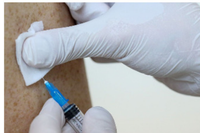
TECH Covid-19 Vaccine Makers Face Russian, North Korean Cyberattacks, Microsoft Says